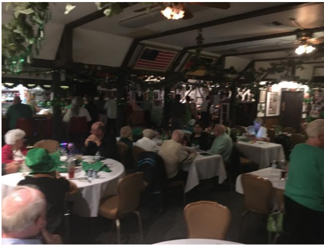
A good crowd showed up for the club's St. Patrick's Day dinner with corned beef and cabbage cooked by Rita and Alwine and music from Melody and the River Cats.