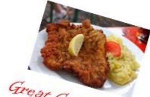
Great German food

Friday April 30 From 5 to 10 pm Brats and Sauerkraut Schnitzel Sandwich and Chips Pretzel's and Apple Strudel