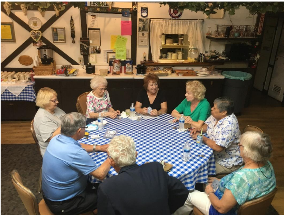
Club members gather for Friday night card games and potluck dinner.