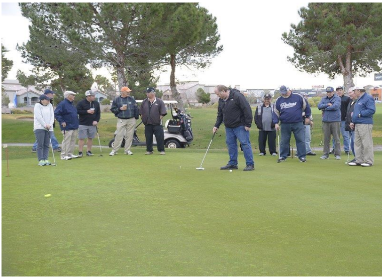
Golfers endured a rainy day for the charity tournament at Durango Hills.