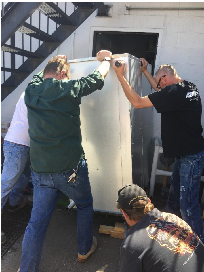
Muscle and ingenuity are needed to bring in the new stove.