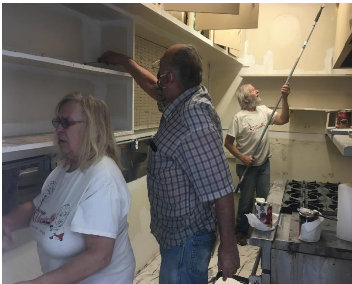
Kitchen renovation starts with a fresh coat of paint.