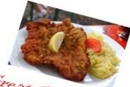
Great German food