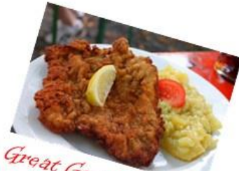
Great German food

Friday Oct 4 th From 6 to 10 pm Opening the Oktoberfest Beer Brats and Sauerkraut