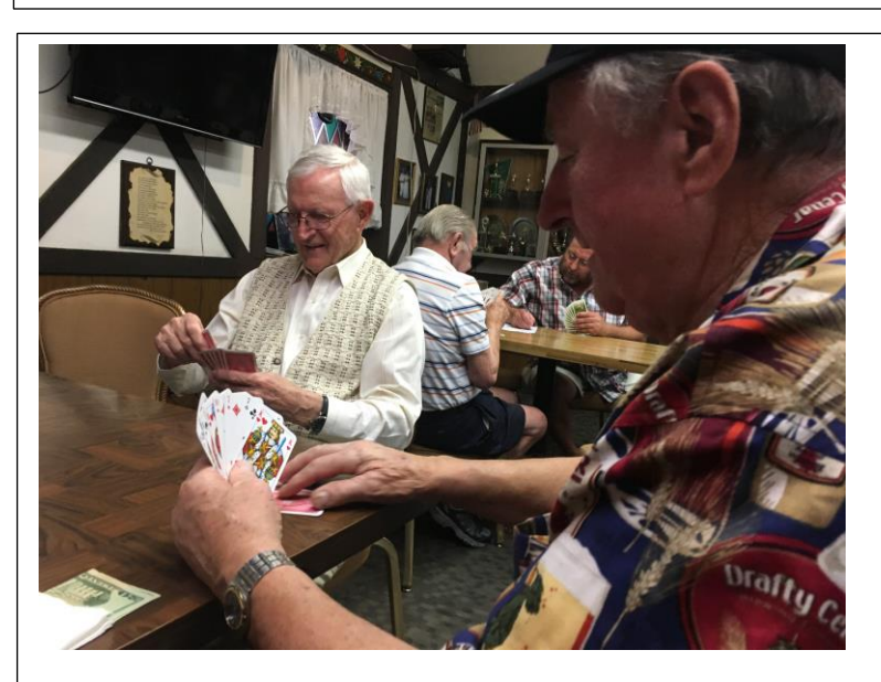
Friday is card night at the German-American Club starting at 5:30 p.m. with a potluck. Bring your "A" game because these guys are sharks.