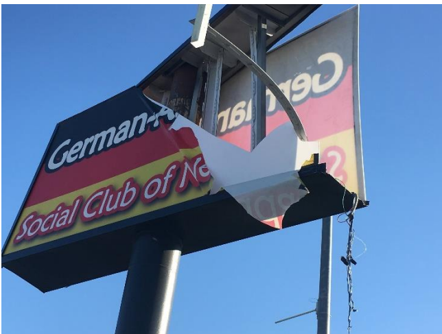
The German-American Social Club of Nevada street sign sustained significant damage in June when a delivery truck for the adjacent Mexican restaurant backed into it. The sign has been repaired through an insurance claim filed by the responsible party, and the club is taking steps to better protect it in the future.