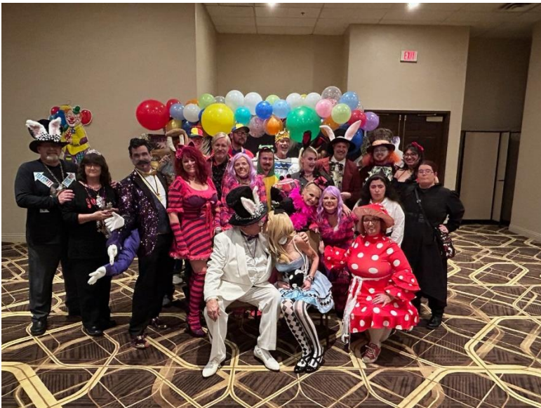
German-American Club members had a fun time as always at GAMGA (German American Mardi Gras Association), held Jan. 13-14 at Tuscany Suites.